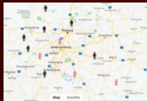
View individual worker details including activity and current positions.

Timecard is a mobile workforce management application that generates PDF forms, photos, digital signatures, GPS tracking information, job costing, time, and attendance from a Smart Phone or tablet. The mobile data captured helps employers manage their mobile workforce better by increasing productivity, reducing time-theft, and streamline the back-office payroll processes.