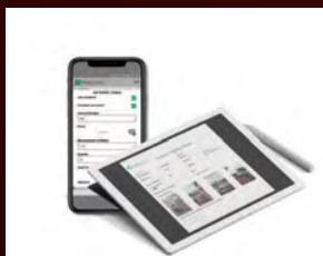
Digital transformation with PDF output.