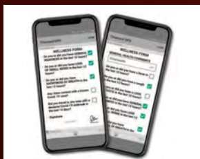
Custom Digital Forms to transform paper processes