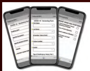
Covid-19 Self-Assessment Forms and Surveys