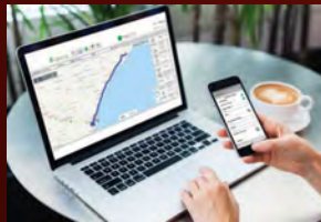
The 'Breadcrumbs' trail views shows speed direction, location and status of workers.